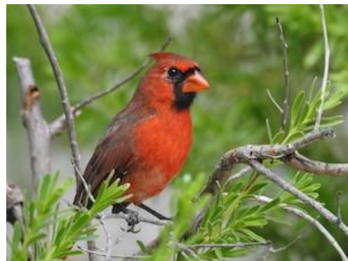
Northern Cardinal .

Donations allow us to provide important conservation services such as improving our free online resources, increasing protection of rare plants and animals, restoring native ecosystems, and advocating for better public policy.